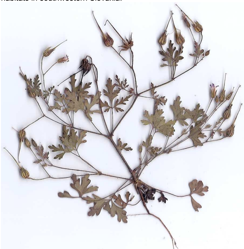
Fig. 1. Herbarium specimen of Geranium purpureum Vill. from the Gáň train stop (SW Slovakia).

In June 2010, several tens Geranium purpureum plants (Fig. 1) were found at the railway stop in the Gáň village. Occurrence of this species has not been previously reported from Slovakia (see Jasičová 1988, Dostál & Červenka 1991, Letz 1996, Marhold & Hindák 1998). After the discovery of the first location in Gáň, the author also examined other stations in south-western Slovakia and the occurrence of G. purpureum was recorded at fifteen other sites (Sereď, Galanta, Šaľa, Trnovec nad Váhom, Komjatice, Tvrdošovce, Nové Zámky, Hurbanovo, Komárno, Mužla, Levice, Kalná nad Hronom, Tekovské Lužany, Bíňa and Štúrovo). Last, the westernmost localities of the species were discovered by P. Eliáš sen. on gravel deposits of the Bratislava – Nivy train station (Eliáš sen. 2010 ined.) as well as I. Jarolímek and M. Petrášová found it also in Kúty railway station (Podroužková-Medvecká et al. 2011). Overall, G. purpureum was currently found at 18 railway stations and stops (Fig. 2). Our results showed that the species is now relatively common alien of railway habitats in southwestern Slovakia.