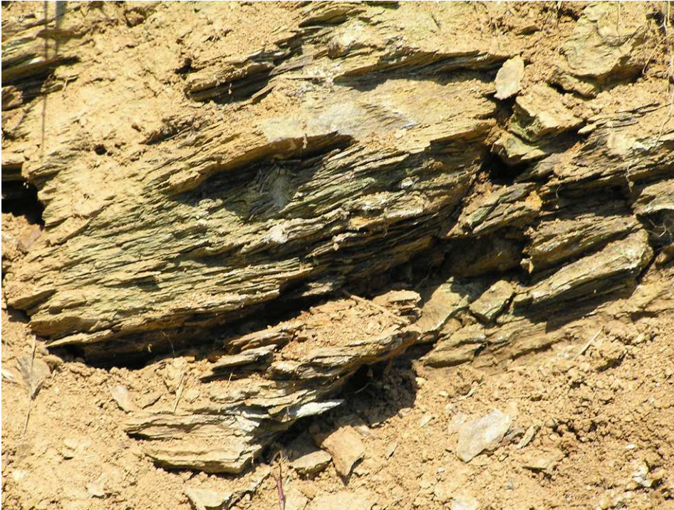
Fig. 2: Graphite phyllites with clearly visible cleavage along schistosity planes.

The weathering of paragneisses and phyllites in the area of the Botanical Garden is considerably restricted. The rocks are deposited in N-S direction with sloping of strata to SW what results to the formation of convex to convex-concave slopes with inclinations of 3 - 17°. The soils on the mentioned rocks are shallow ones of cambisol type. The upper part of the garden is covered by the so-called natural forest which is represented by the forest stands planted in the time of the Botanical Garden foundation, consequently not maintained, extended to the highest parts of the garden bordering with the magnesite mine in Bankov location. Particularly, they are the plantations of both native and introduced woody species, namely: Acer platanoides L., Robinia pseudoacacia L., Quercus petraea (Mattusch.) Liebl., Cerasus avium L., Tilia platyphyllos Scop. and Ulmus laevis Pall.. As accessory coniferous elements, there occur Larix decidua Mill. and Pinus sylvestris L.. In several parts of the garden there was preserved the schematic combined plantation of the woody species Tilia platyphyllos and Quercus petraea originally carried out by professor Samuel Kriška. Nowadays, these stands on shallow soils are of exceptional soil conservation and melioration value.