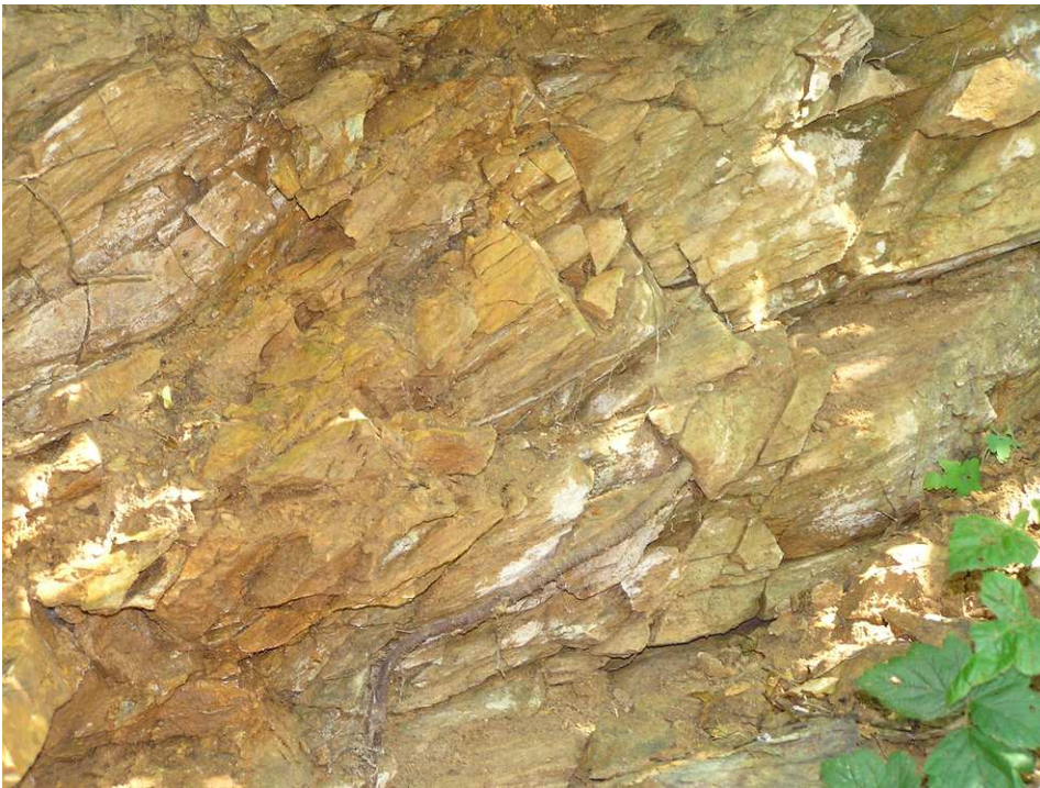
Fig 1: Two-micas paragneisses of former flysch nature with interbeds of minerals.

In the next exposure (Fig. 2) the graphite phyllites emerge. They are of light yellow colour with brownish tone (as a result of weathering). Mineral composition is as follows: flint, senicite, ore pigment, chlorite, up to 1 mm sized garnet grains. They have good cleavage along schistosity planes.