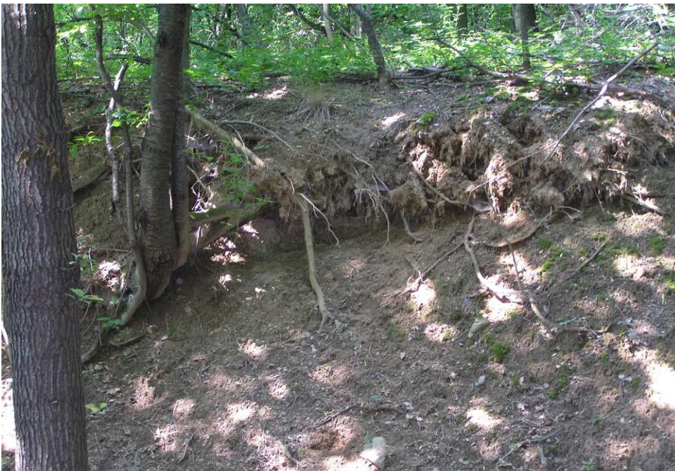
Fig. 4: Erosion on slopes of former intercepting ditches.

Deep diluvia with a considerable portion of loess fraction (diameter 0,01 – 0,05 mm), with the occurrence of terrace planes as suitable anti-erosion measures, were artificially excavated, they are 3 to 8 m deep furrows which sides are liable to high soil erosion (Fig. 4). Originally they played a significant role in slope stabilization and fixation against whole erosion on slope surface and against soil deflation.