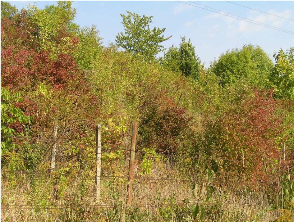
Fig. 5: View of the anthropogenic terraces of the former vineyard with self-sowing vegetation

In the south-western part of the area we follow the suitably adjusted fields formerly designed as vineyards and orchards. These areas are abandoned from grower point of view due to unsolved property rights and there is self-sowing of various expansive woody species - Fraxinus excelsior L., Acer campestre L., Acer platanoides L., Swida sanguinea L., Rosa canina L., Rubus fruticosus L., Ligustrum vulgare L., Prunus spinosa L. and Clematis vitalba L., which cause that these terraces are somewhere totally impassable (Fig. 5). Even in spite of vegetation self-sowing, e. g. in the area of the vineyard, there is successive erosion of soils and landslide of terraces.