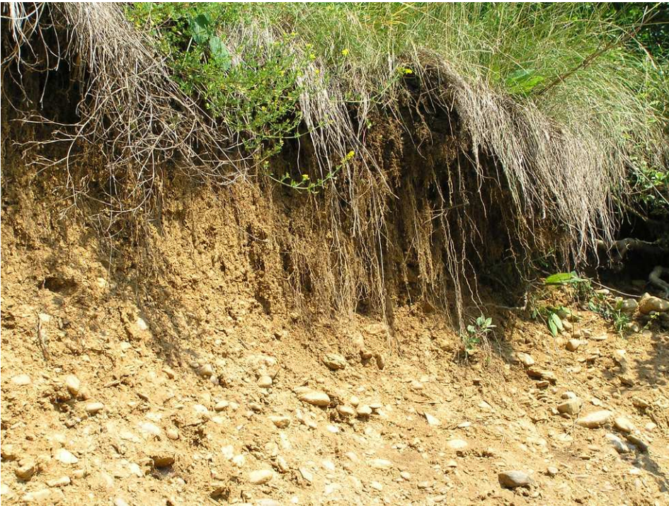
Fig. 3: Clearly visible gravel sands of the river terrace of Hornád river.

Next to the area with outbuildings and greenhouses, there is preserved the surface with relative altitude of 14 – 22 m. Morphologically it represents a Hornád terrace from the Middle Pleistocene – Riss 1. The gravels are of more fresh appearance, with grain diameter of 6 – 12 cm and depth to 150 cm.