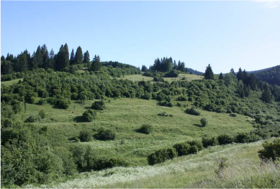
Fig. 2. European hazel stands in the Turiec region country.