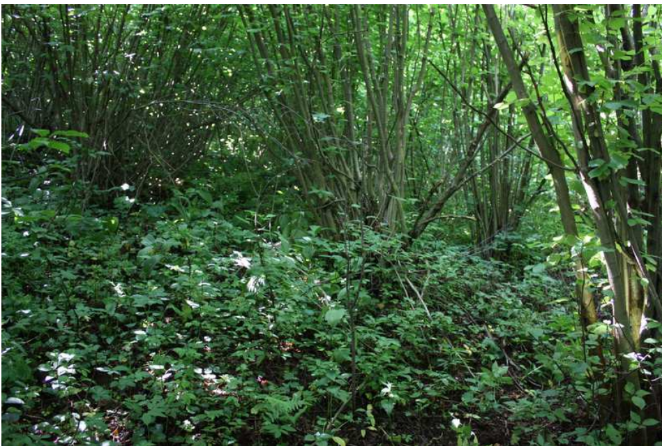
Fig. 3. Interior of the European hazel stand (relevé No. 2 in Tab. 1).