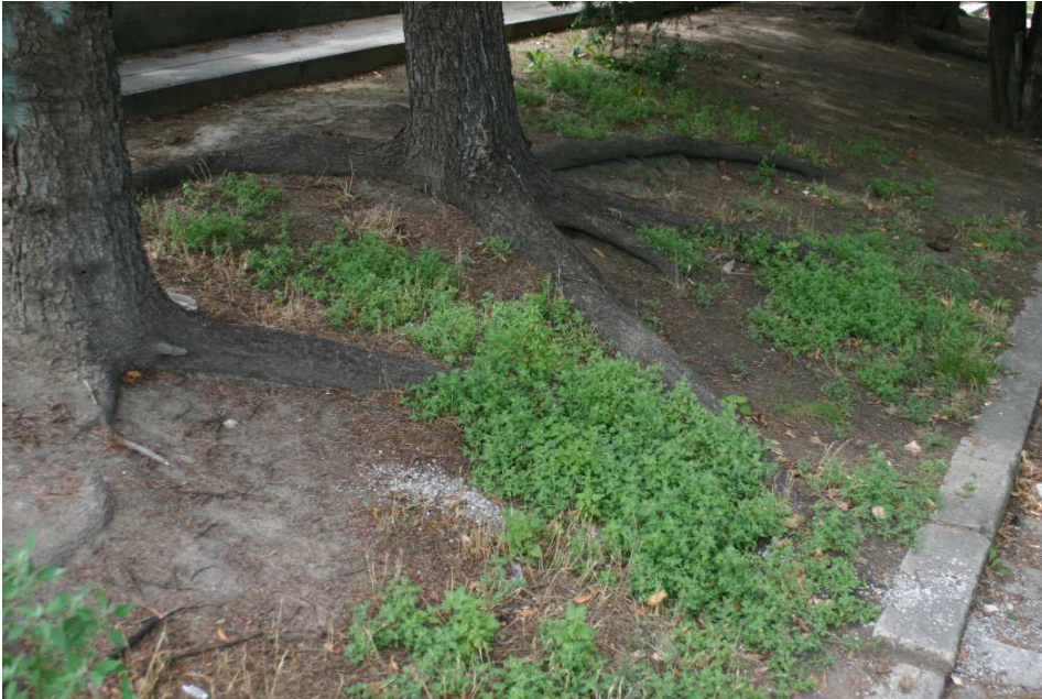
Fig. 3 Chenopodium vulvaria L. in the locality of Námestie Osloboditeľov, in Košice.

North Patagonia, Chile, Australia and New Zealand. In Slovakia (MARHOLD & HINDÁK 1998), it is distributed sparsely, especially in warm regions. In connection with the rebuilding of town residential areas and changed life style in cities, this species vanishes. In Košice, it occurs in a built-up area with favourable conditions (temperature, humidity, disturbance).