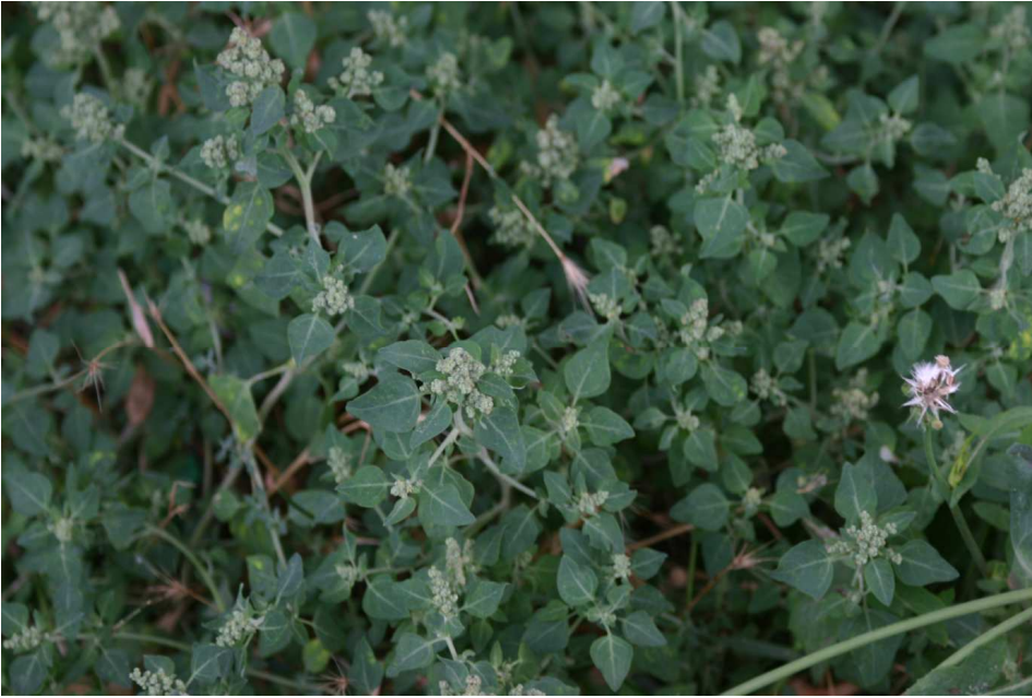
Fig. 1 Chenopodium vulvaria L. - flowering plants in the locality of Košice