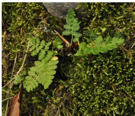
Fig. 2 Woodsia ilvensis in the Mount Kobyla (near the village of Kobyletska Poliana, Zakarpattia region).