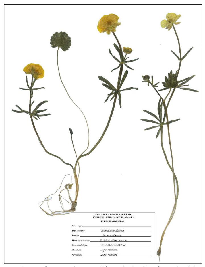
Fig. 1 Herbarium specimens of Ranunculus degenii from the locality of Restelica.