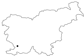
Fig. 2. Localization of the noted occurrence of Q. banatus within Slovenia.

The first noted locality (coordinates 45°39.9580' N, 13°59.4780' E, ± 10 m) is situated in the natural bridge between the collapse dolines Velika dolina and Mala dolina. Two young trees (Fig. 3) grow here directly at the left side of the tourist trail on the upper part of steep slope of the Velika dolina, somewhat below the splitting-up of the trail to the village of Škocjan and the Information Centre of the Škocjan Caves Regional Park.