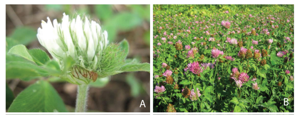
Fig. 1. (A) Snow clover ( Trifolium pratense ssp. nivale ) – maternal plant, (B) red clover ( Trifolium pratense ssp. sativum ) cultivar Nika 11 – paternal plants