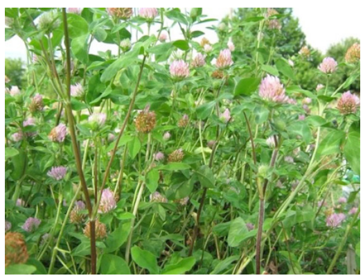
Fig. 2. F_1 plants obtained by cross a snow clover ( T. pratense ssp. nivale ) with red clover ( T. pratense ssp. sativum ) in second vegetation year