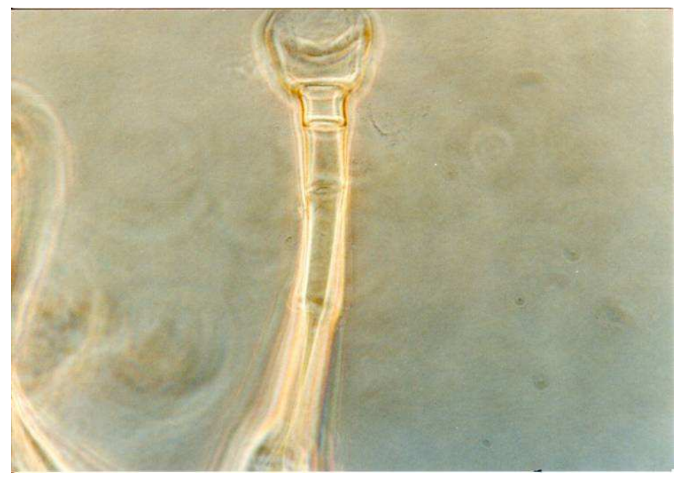
Fig. 2. Grandular hair of Salvia nemorosa in the moment of pushing out of volatile oil.

The higher concentration of toxic elements in plant drugs, e.g. As or Pb, may be dangerous, since the elements are dissolved in the extracts and may get into the human and animal body (ALVAREZ-TINAUT et al. 1980, MATTINA et al. 2006).