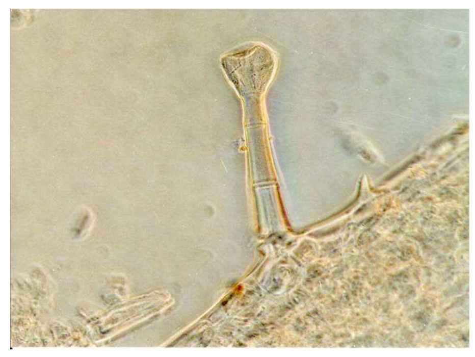
Fig. 3. Grandular hair of Salvia verticillata.