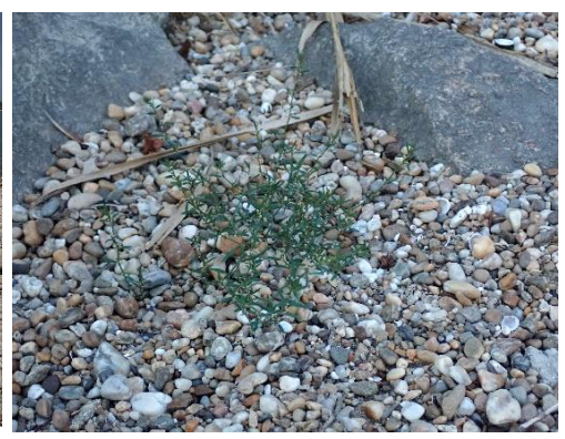
Fig. 3 Polygonum graminifolium in Slovakia, Komárno.