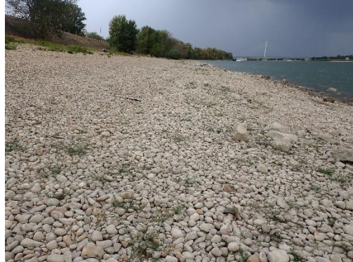
Fig. 2 Typical habitat of Polygonum graminifolium, Komárom (Hungary).

In Komárom, there are mostly no other plants in the habitat of Polygonum graminifolium . Other species were recorded mainly where some silt or sand has been deposited between the stones: Chenopodium glaucum L. (locally common), Persicaria dubia and P. lapathifolia (L.) Delarbre (uncommon), Amaranthus sp. (seedling), Bidens frondosa L., Butomus umbellatus L. (seedling), Carex sp., Chenopodium album L., C. rubrum, Cirsium arvense (L.) Scop. (seedling), Cyperus fuscus (on muddy soil patches), Digitaria sanguinalis (L.) Scop., Lycopus europaeus L., Plantago altissima L., Polygonum arenastrum Boreau, P. aviculare, Populus × euramericana (seedlings), Portulaca oleracea, Ranunculus sceleratus L. (seedling), Rorippa sylvestris, Rumex sp. (seedling), Salix alba L. and S. purpurea L. (seedlings). Most of these species had only one or very few individuals.