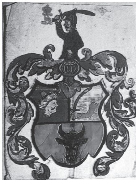
Fig. 3. Application of Laurentius Jakus–Kis, 1563 (MOL NRA 723/50. Photo: MOL©)