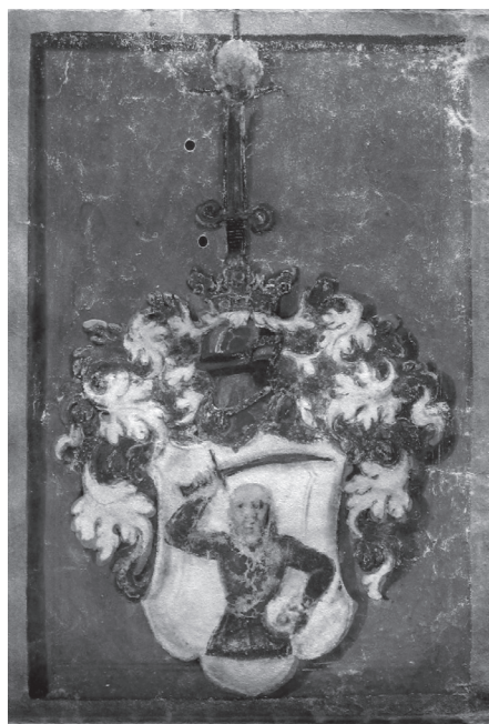
Fig. 1. Chief Judge Stephanus Pap, 1580 on his armorial bearing (BAZML XV.3.50. Photo: Tamás Bodnár–BAZML©)