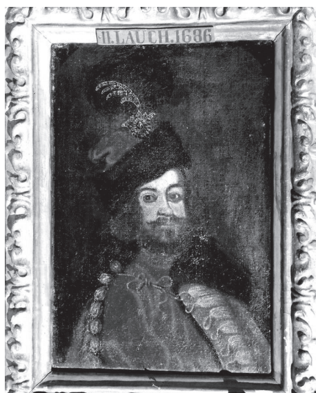
Fig. 4. Vice-comes Andreas Aszalay, 1682. Oil, canvas (DIV KGY Inv. No 55.538. Photo: G. Kulcsár)