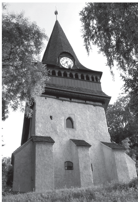
Fig. 2. Bell Tower built in 1554