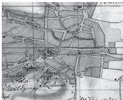
Fig. 1. Map of Miskolc, around 1770