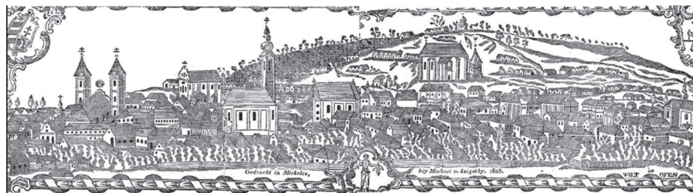
Fig. 4. View of Miskolc on a guild's certificate, 1825.