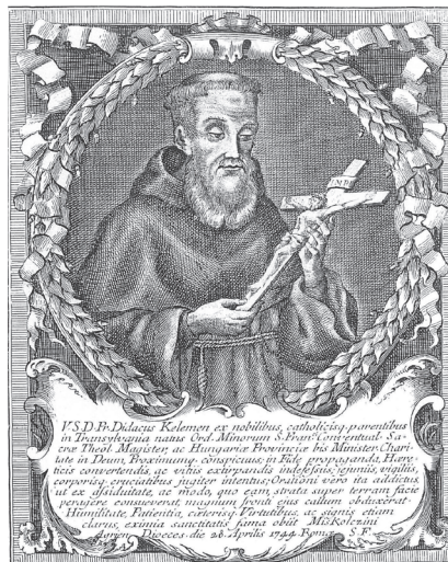
Fig. 2. Didacus Kelemen, engraving, late 18 th century (AG OFMConv©, after Rákos, 1979)