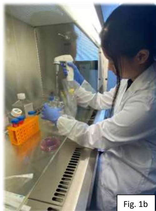
Fig. 1a/b: The students at work in the laboratories of the Department