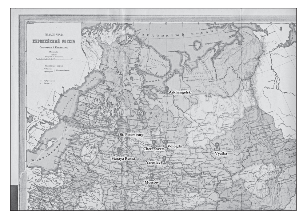
Figure 1: Map of the northern region of European Russia<sup>6</sup>

The year of 1870 was the turning point in urban pollution and urban sanitation in the Russian Empire. After the reform of city self-government of 1870, the urban environment and its sanitary conditions became the object of the policy of local authorities, upon which fell the responsibility to address the economic issues of local importance. Moreover, Russia was a country with delayed modernization, where industrial development and population growth started in the last third of the nineteenth century. The Vologda and Novgorod regions had had an agrarian specialization; therefore, bacteriological pollution was the main environmental problem in the cities of both regions. This type of pollution has been an object of some historical research since the 1980s. Works by A. Corbin, D. S. Barnes and R. Evans allow us to follow the evolution of the perception of everyday odours in French society (A. Corbin), the role of the miasmatic and the bacteriological theories in the environmental measures of a government (D. S. Barnes) and the dramatic consequences of bacteriological pollution due to a misguided policy of sanitary protection (R. Evans).<sup>7</sup>